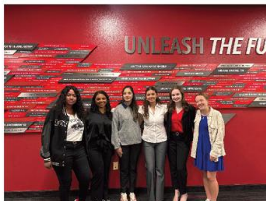
2025-26 Scholarship Recipients

SCSU Student Organization & Saint Cloud Area (MN) Branch