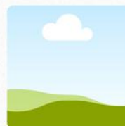
OPEN VP of Communications