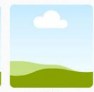
OPEN Fundraising Committee