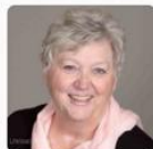
Rene Kaluza Website