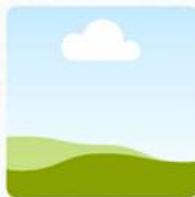
OPEN Recording Secretary Alternate