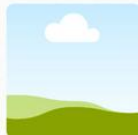
OPEN Monthly Program Chair