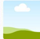
OPEN Ads & Fliers