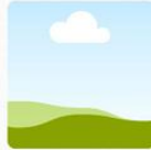
OPEN Social Media