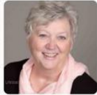
Rene Kaluza Website