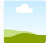
OPEN VP Programs