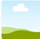
OPEN Monthly Program Chair