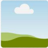
VACANT Branch President