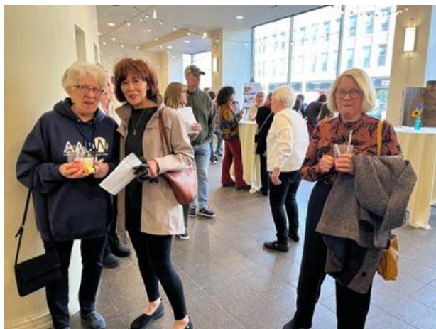
Lots of great food and sorbet floats!

AAUW had the pleasure of being a sponsor at the 2023 High School Juried Art Exhibition on Friday, April 28, at The Paramount, an experience that showcased student work from across Central MN.