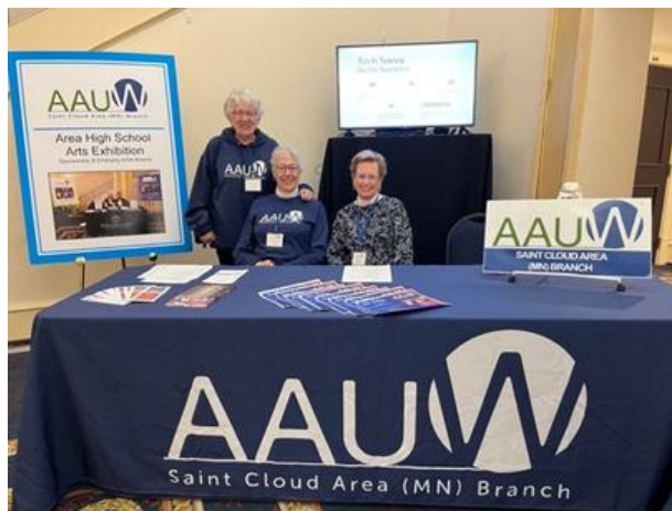
The AAUW information table